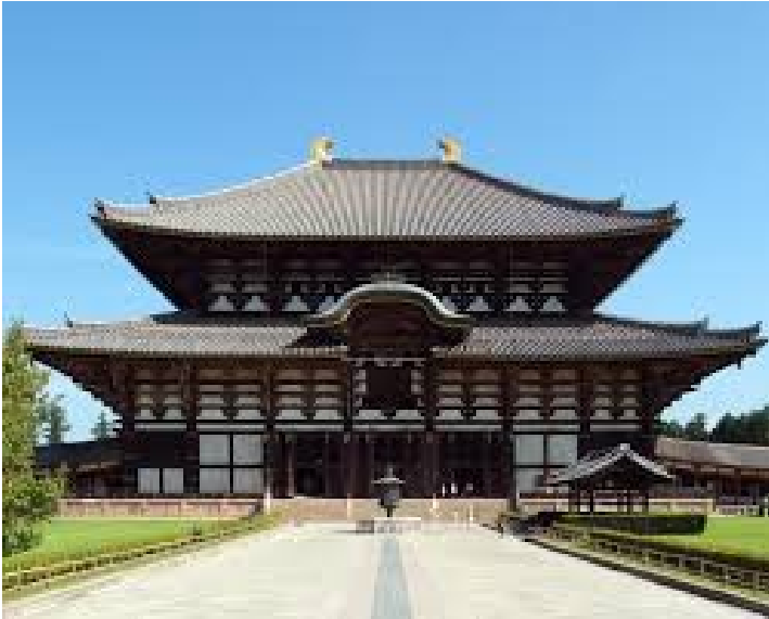
Typical Japanese building